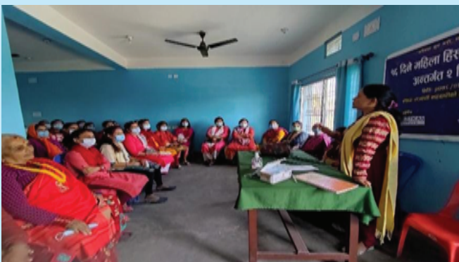
GBV training sessions by JMSK Biratnagar.

In the training, they were taught about GBV, its types and its mitigation measures and they were also informed about women and children rights during the training sessions.