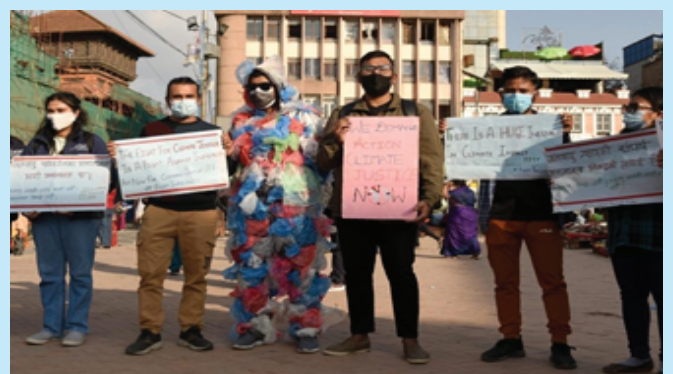
Activists showing the present Kathmandu Valley situation through plastic wear.

The social activists demand climate justice during this event in Kathmandu at Basantapur Durbar Square. Altogether there were nineteen organizations like Jagran Nepal, NIDWAN, Digo Bikas etc. were present at the moment to show their unity for asking climate justice. Organizations that are working on women rights and gender equality like Jagran Nepal demands climate justice through gender justice with their slogan “No Climate Justice without Gender Justice.”