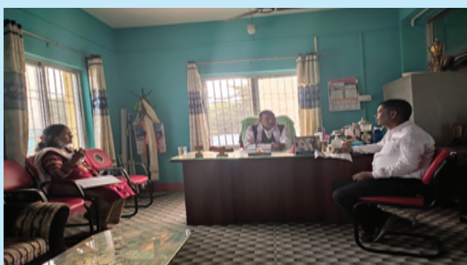
Jagaran Nepal Field Office, Counselor discussing with Health department representative about the post-COVID 19 major issues at the community level.