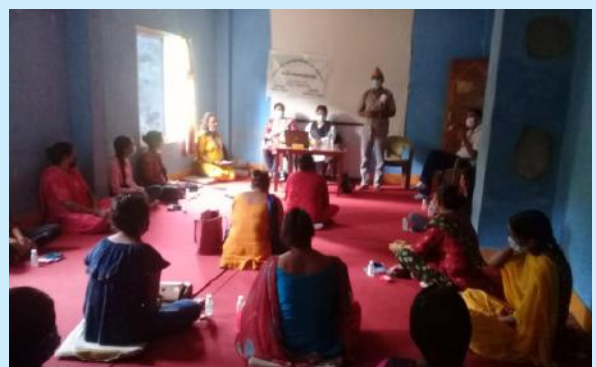
Participants during the awareness program on COVID-19 pandemic, Dadeldhura, Nepal

Awareness raising program on COVID19 and Women Issues in Chhaupadi affected Districts. JN has carried out this activity in its two working districts, Achham and Dadeldhura. The activity is coordinated under the leadership of Ms.