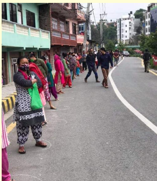
Local people of Kathmandu Metropolitan city in a queue, maintaining social distance to receive relief package distributed by Jagaran Nepal.

limited access to social protection as well. Similarly, In South Asia, 80% of women in non-agricultural jobs are in informal employment which breaks down the women's economic sustainability even high during the pandemic. From the past and emerging data, it is possible to project that the impacts of COVID-19 global recession will result in a prolonged dip in women's incomes and labor force participation, with compounded impacts for women already living in poverty.