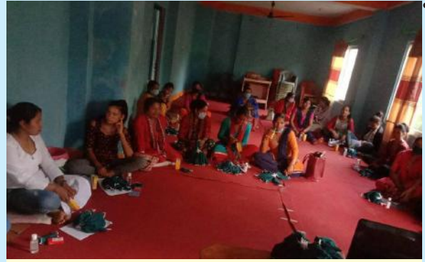
Distribution of COVID-19 relief materials on Chhaupadi working areas of Upholding Rights of Minorities Beyond Borders (URMB) project, Achham, Nepal

Distribution of COVID-19 relief materials on Chhaupadi working areas of Upholding Rights of Minorities Beyond Borders (URMB) project. Total of 100 masks were distributed, 500 each on Achham and Doti districts to marginalized and deprived women of remote areas as a focus most to those from chhaupadi affected districts.