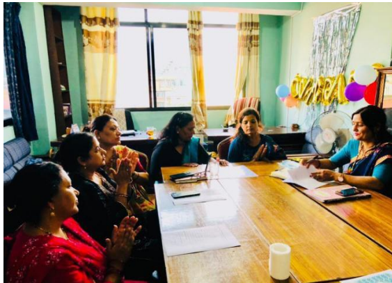
Pictures showing board members discussing different issues in 22 nd AGM Image287.JPG