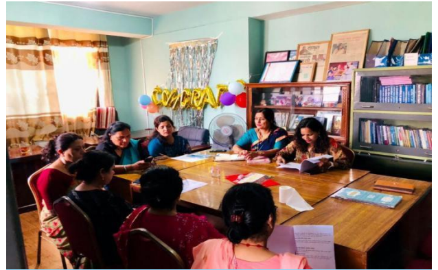
Pictures showing board members discussing different issues in 22 nd AGM