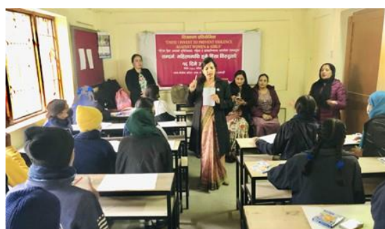
Picture: JN's president sharing information on Gender Based Violence