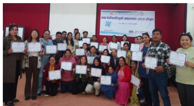
A group photo taken after the completion of training