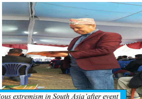
Distribution of book named 'Shadow of religious extremism in South Asia' after event