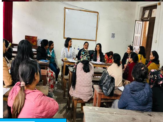
Picture taken during event