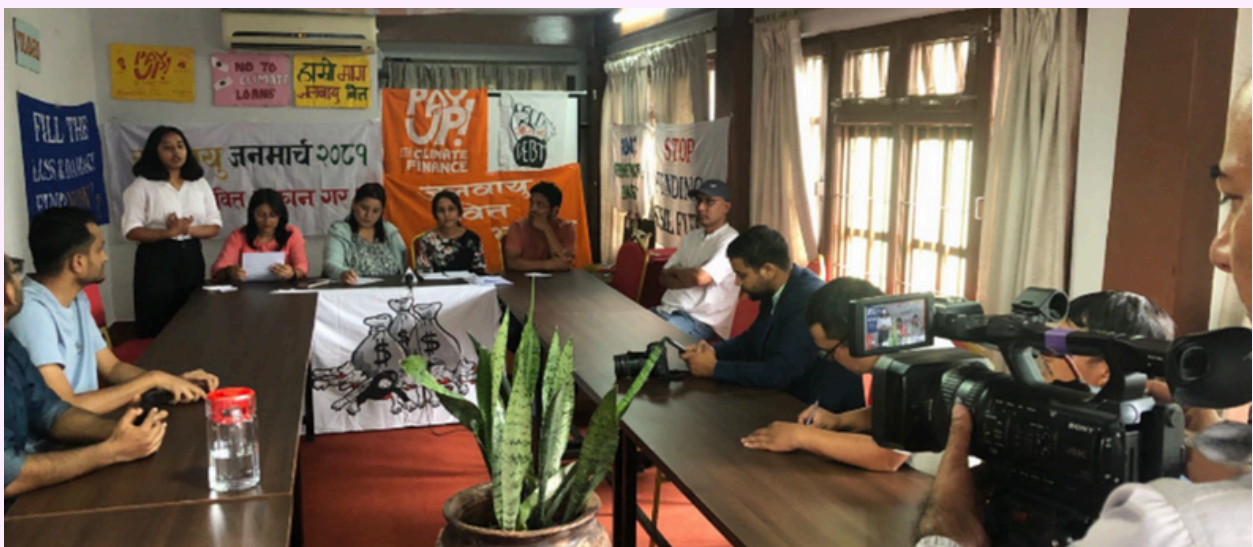
Press Conference – People's Climate March (PCM) 2024