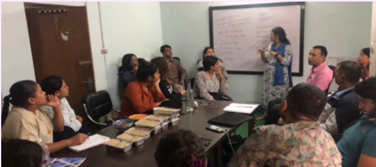
2nd Preparation Meeting – People's Climate March (PCM) 2024