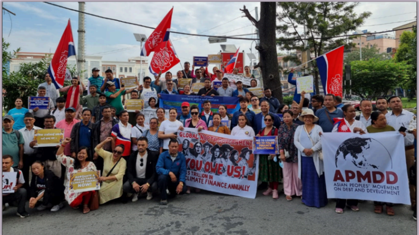
APMDD member Organization's Peaceful Demonstration at Maitighar, Kathmandu

Jagaran Nepal with other civil society organizations, activists and representatives of media were part of a peaceful gathering and demonstration program on 20th September at Maitighar, Kathmandu. The demonstration was organized in the preliminary days leading up-to the “Summit of the Future” convention which was held in New York City, USA, on September 22 and 23.