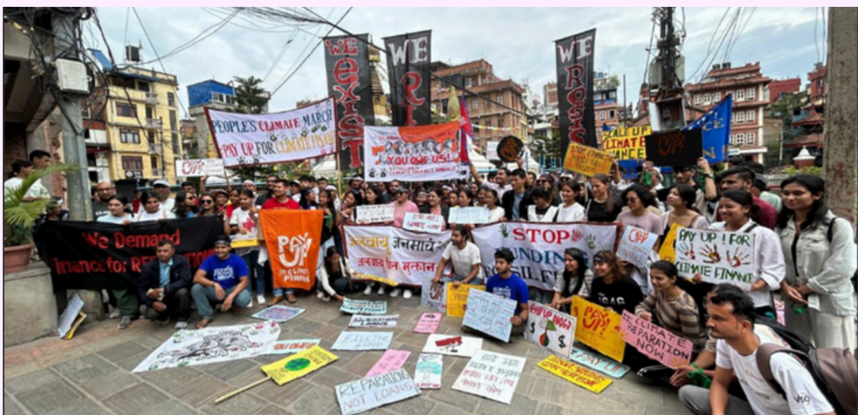
Activist gathered in Solidarity at Patan Durbar demanding #PayUp for Climate Finance