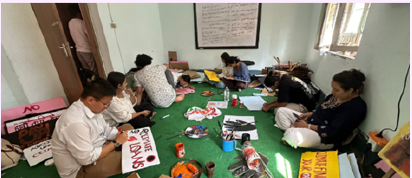
Art Workshop - People's Climate March (PCM) 2024