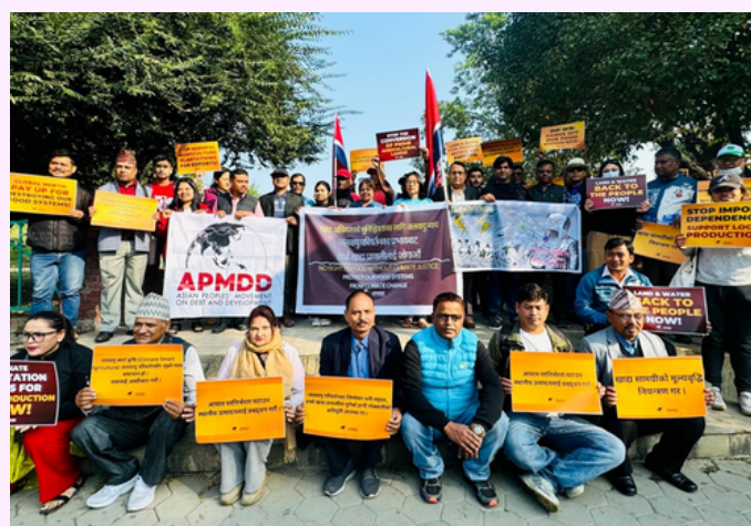
APMDD's Nepal Chapter member organizations with banners in the demonstration