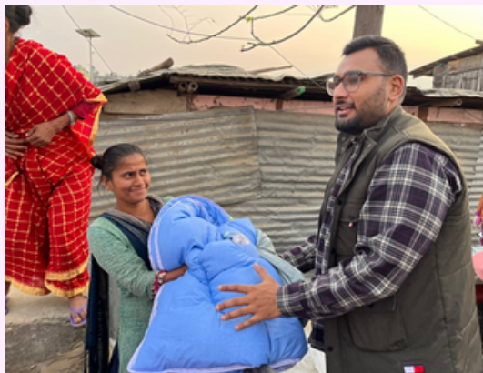
Jagaran Nepal's President, Secretary, Technical Advisor and Member distributing relief materials